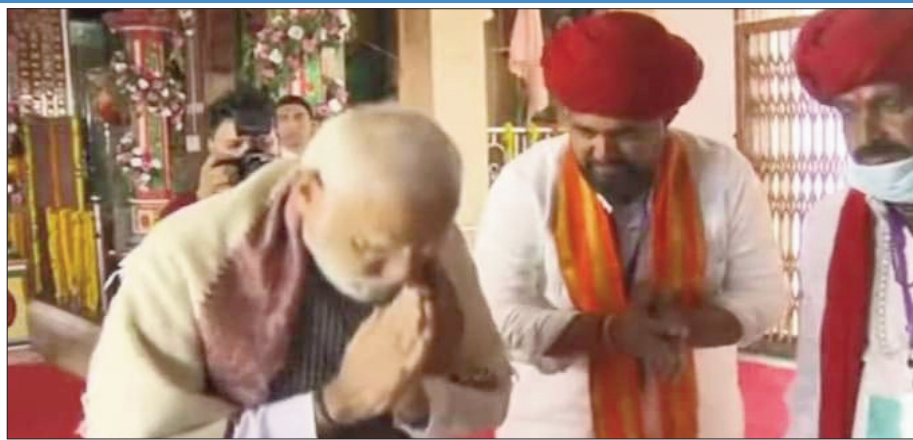
Modi said that Lord Devnarayan was born on a lotus flower. It is a coincidence that we, too, are born of the lotus. He said this is where great men like Pabuji Tejaji,

He said that Rajasthan is a land of heritage. The beauty here is unique.