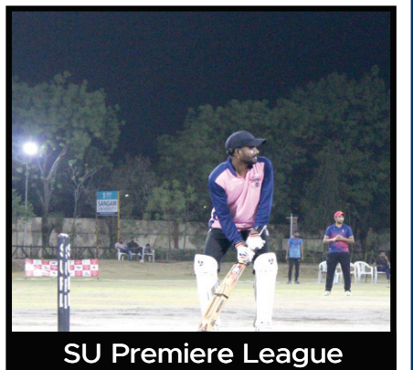
SU Premiere League