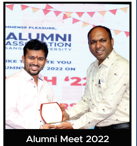
Alumni Meet 2022