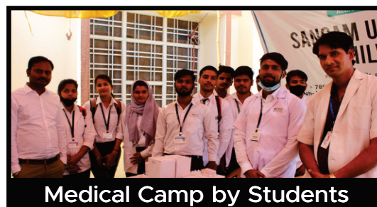
Medical Camp by Students