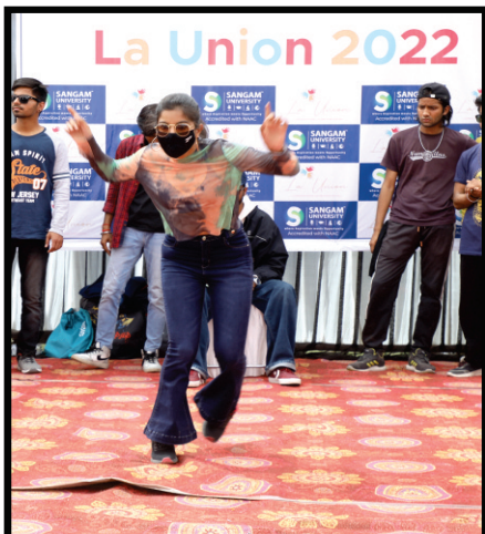
LA Union 2022