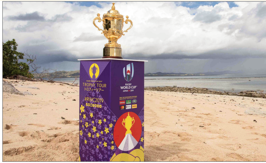
Mumbai: The 2019 Rugby World Cup Trophy, the Webb Ellis Cup has reached India,

- The Webb Ellis Cup is visiting four cities as part of the Rugby World Cup 2019 Trophy Tour - Land Rover is one of the partners of the 2019 Rugby World Cup that will be held from 20th September to 02 November 2019 in Japan - Land Rover has proudly supported the sport for nearly two decades, from grassroot to the highest levels